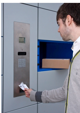
Simple keycode access

An optimal deployment network was developed together with a design and sourcing plan incorporated within a five year business plan.