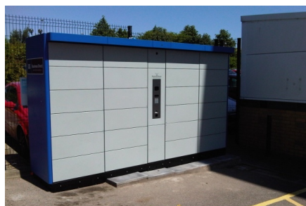
The DX Parcel Xchange Unit